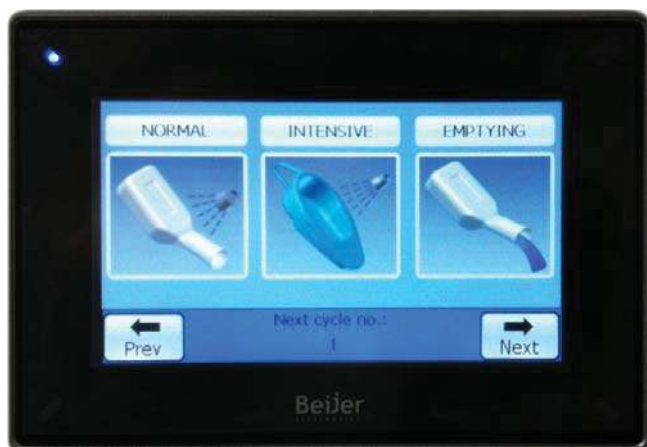
ABOVE: TOUCH SCREEN USER DISPLAY PANEL

NORMAL: 10 MINUTES INCLUDING FLUSH, SHORT WASH & DISINFECTION IDEAL FOR BOWLS, BOTTLES.